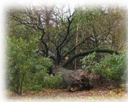
Tree damage from Hurricane Sandy

In October of 2012, Hurricane Sandy roared through New Jersey, taking out the huge, old maple tree, which took down the river birch tree and one of the benches.